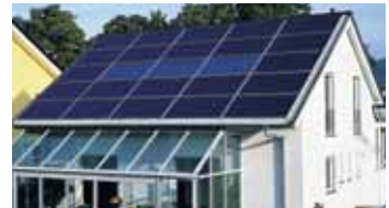
Complete roof installation