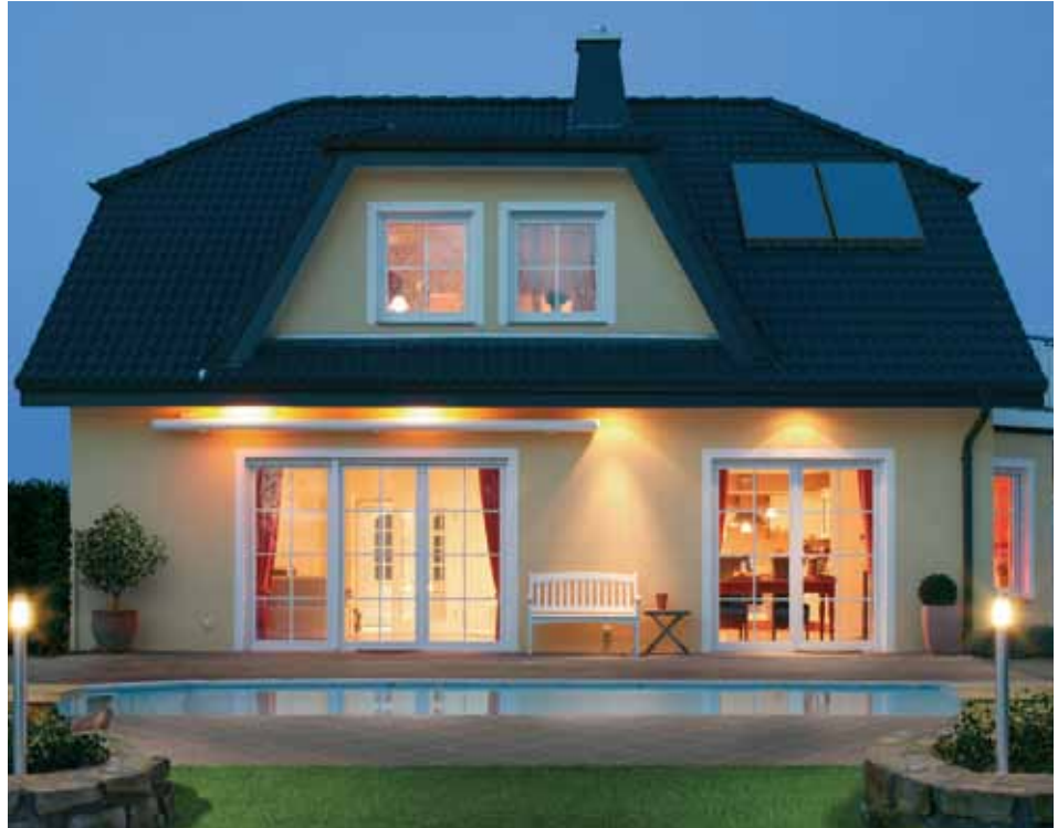
Compact on-roof installation

The Compact line products represent uncompromising quality at attractive prices. This is achieved by focusing on the three most common installation methods and an attractive frame colour.