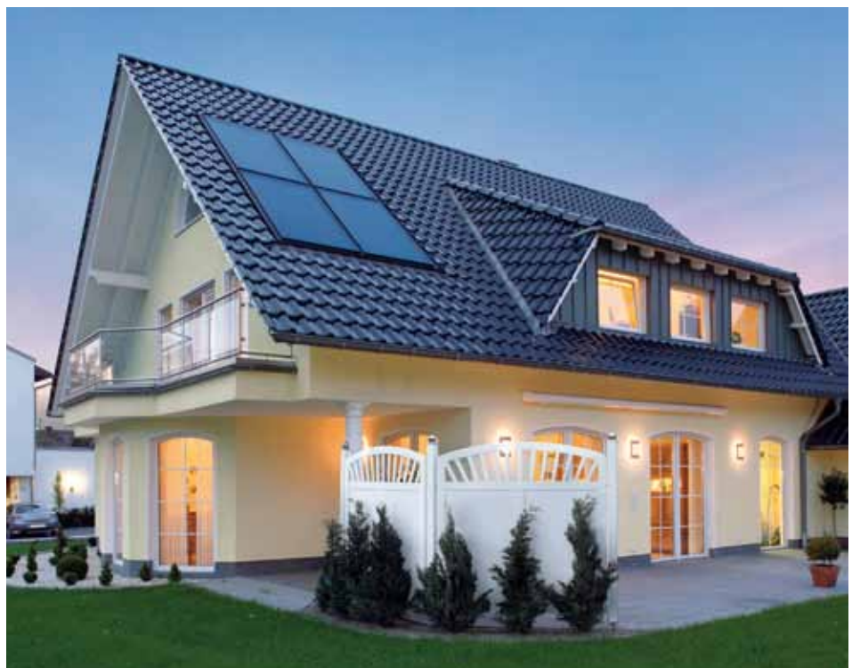
Premium in-roof installation

Within the Premium line, any combination of photovoltaic modules, thermal collectors, hot-air collectors and roof windows can be used. The SchücoSol DG double-glass collector is an exclusive innovation in the Premium line which provides a clear surplus for auxiliary heating and is particularly suitable for high-temperature processes. The range of solar storage cylinders for the Premium line is characterised by accessories such as layering and fresh water technology.