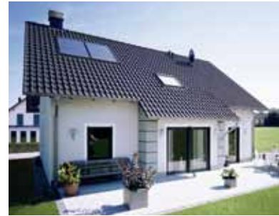
Family home with solar thermal system for hot water supply

Schüco provides expertise and components for designing individual systems for apartment buildings and special applications that are not covered by the Schüco range of solar packages. Schüco actively supports the design of buffer storage cylinders, fresh water stations and domestic hot water stations in order to find the optimum solution for our customers.