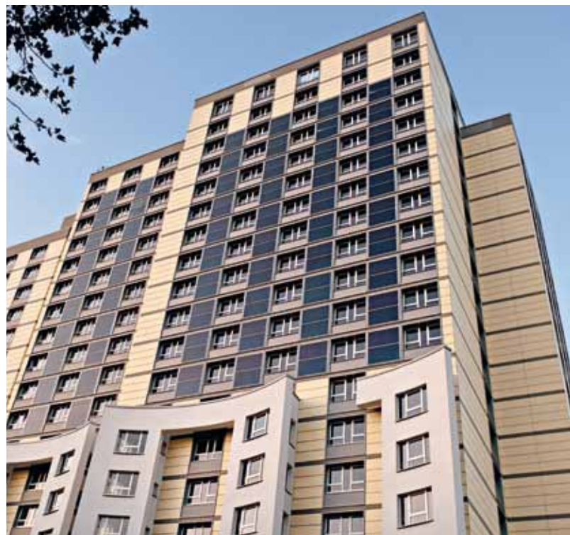
Large thermal system in the façade of an apartment block

For large-scale projects, Schüco supplies custom-made solutions for hospitals, hotels, restaurants and agricultural use. The comprehensive product portfolio also allows highly complex solutions to be created from a single system. Schüco consultants and the project office provide support in project planning and component combinations.