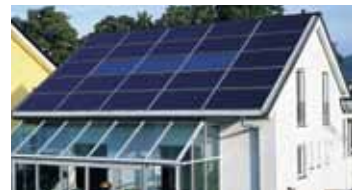
Complete roof installation