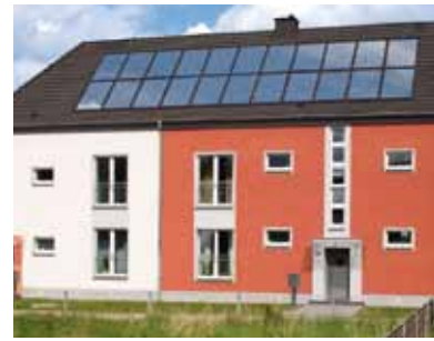
Apartment building with solar thermal system for auxiliary heating