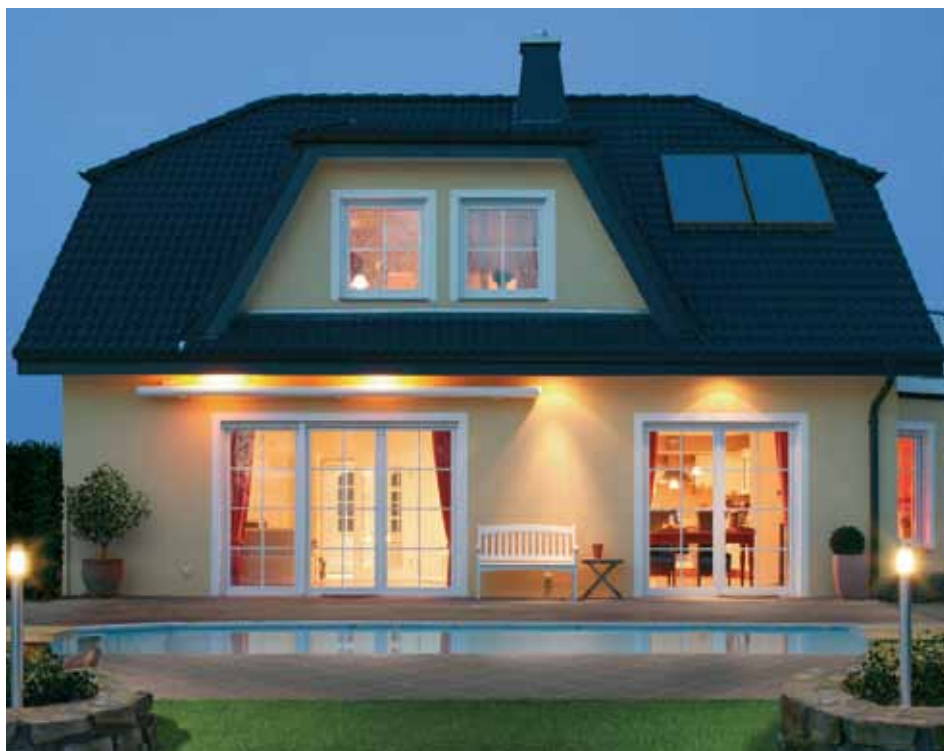
Compact on-roof installation

The Compact line products represent uncompromising quality at attractive prices. This is achieved by focusing on the three most common installation methods and an attractive frame colour.